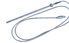
PT 100.5 Temperature sensor