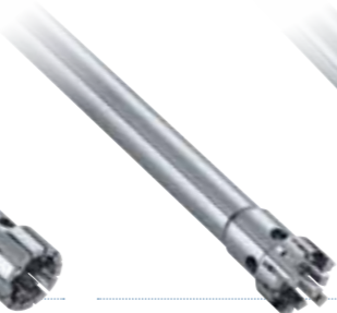
S 25 KV - 25 G Dispersing element

Ultimate fineness, suspensions: 15 – 50 µm Ultimate fineness, emulsions: 1 – 10 µm