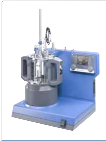
LR 1000 control Package