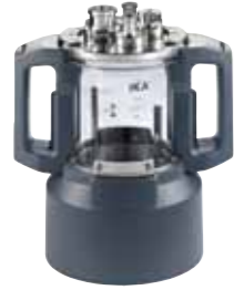
LR 1000.1 Laboratory reactor vessel