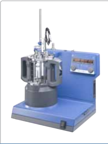
LR 1000 basic Package