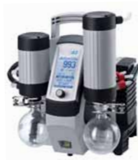
SC 920 Vacuum pump

The SC 920 vacuum pump system supports remote control over a portable hand terminal, thus ensuring maximum flexibility in the laboratory