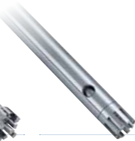
S 25 KV - 18 G Dispersing element

Ultimate fineness, suspensions: 10 – 50 µm Ultimate fineness, emulsions: 1 – 10 µm