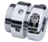
LR 1000.41 Shaft receptacle

To install the dispersing elements S 25 KV Material of seal: FKM