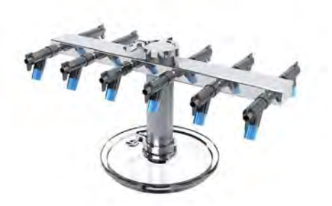
Stackable 12 port manifold with adaptor plate