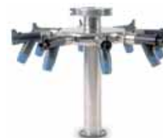
8 port manifold