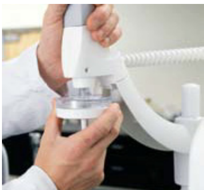
Millipak® Express 40 replacement

The service program portfolio covers all maintenance requirements such as installation, customized user training, scientific and technical support, troubleshooting, preventive maintenance visits, and all validation requirements using ad hoc calibrated equipment, procedures, workbooks and suitability tests within a GXP's environment.