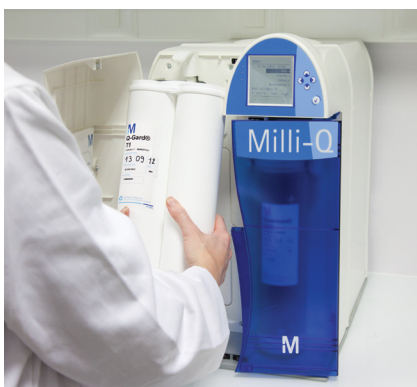
Q-Pak® polishing cartridge replacement