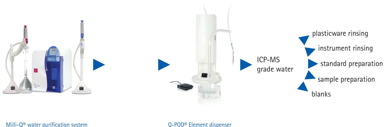
Milli-Q® water purification system

Inductively coupled plasma mass spectrometry (ICP-MS) instrumentation performances and capabilities are continuously improving, which brings new challenges to the services, reagents, and tools used to optimize the overall analytical method. The wide use of ultrapure water to prepare samples and standards, clean and rinse plasticware and ICP-MS components, or run blanks, makes it a critical component of the analytical method. The Q-POD® Element unit was designed to fulfill the stringent requirements of trace elemental analysis.