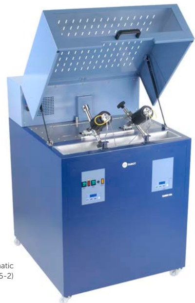
› Seta RōBot Bath (15200-5) with automatic pressure monitoring (15205-2)

Visit: http://www.stanhope-seta.co.uk/3467/Seta-RoBot-Bath