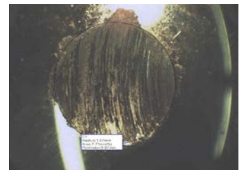
› Image capture of scar using Microscope with Digital Camera (19750-3)

Existing users of the Microscope can purchase the camera separately (19755-0).