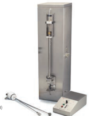
› Seta Autowash (14024-0)