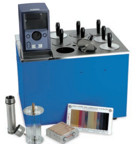
› The Copper Corrosion Bath (11400-7)

2 Station Bath (11300-2): http://www.stanhope-seta.co.uk/4440/Seta-Copper-Corrosion-Bath