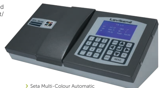
› Seta Multi-Colour Automatic Colorimeter (15260-4)

Visit: http://www.stanhope-seta.co.uk/3993/Seta-Lovibond-Colour-Comparator