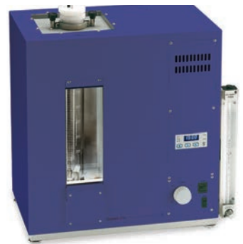
› Setafoam 150 High Temperature Foaming Characteristics (14025-0)