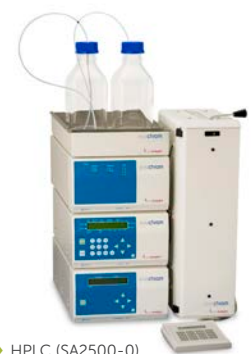
› HPLC (SA2500-0)

The Evochrom Base Oil HPLC instrument is a complete plug and go system, fully specified for Aromatic and Saturates. The system is ready for use out of the box with minimal configuration required.