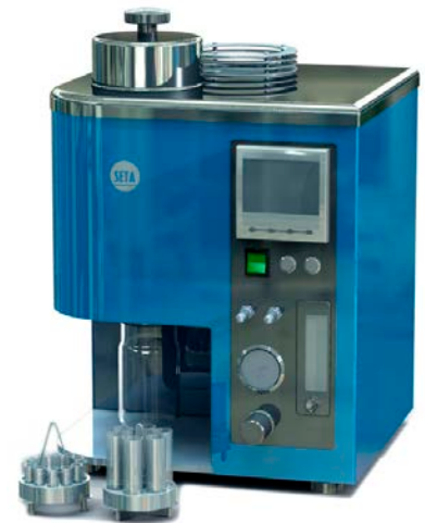
› Carbon Residue (97400-3)