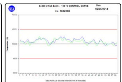
➤ Typical example of stability at 40°C and 100 °C