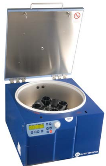
› Seta Oil Test Centrifuge (90000-3)

6 Place (90100-0): http://www.stanhope-seta.co.uk/4807/Seta-6-Oil-Test-Centrifuge