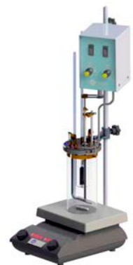
› Seta Aniline Point (10000-2)

Visit: http://www.stanhope-seta.co.uk/4824/Thin-Film-Apparatus