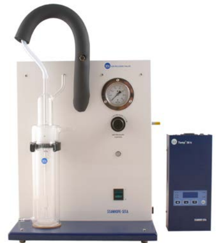
› Seta Air Release Apparatus (15850-5)

Visit: http://www.stanhope-seta.co.uk/4371/Seta-Air-Release-Value-Apparatus