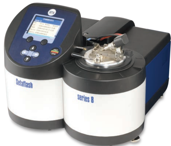
› Setaflash Series 8

View video online: www.stanhope-seta.co.uk/setaflash.html