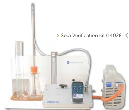
› Seta Verification kit (14028-4)

Visit: http://www.stanhope-seta.co.uk/3292/Foam-Verification-Kit