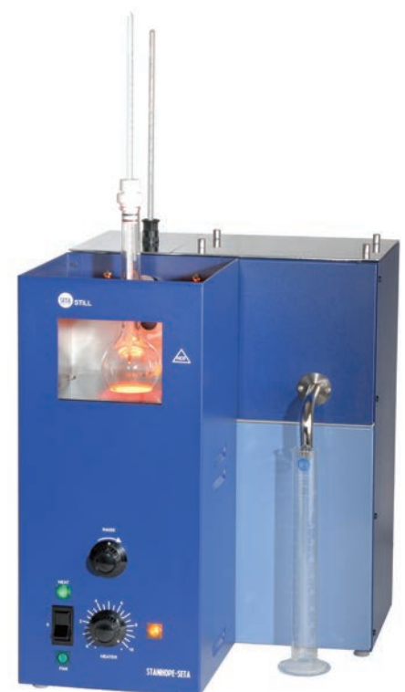
› Setastill (11860-3)

Visit: http://www.stanhope-seta.co.uk/3391/Setastill-Distillation