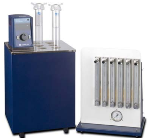
› Seta Oxidation Bath (16900-6)

Visit: http://www.stanhope-seta.co.uk/4462/Oxidation-Bath-with-Oxflo-Controller