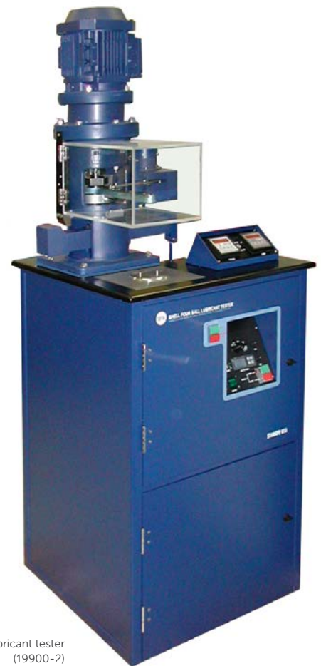
› Seta-Shell 4-Ball Lubricant tester (19900-2)