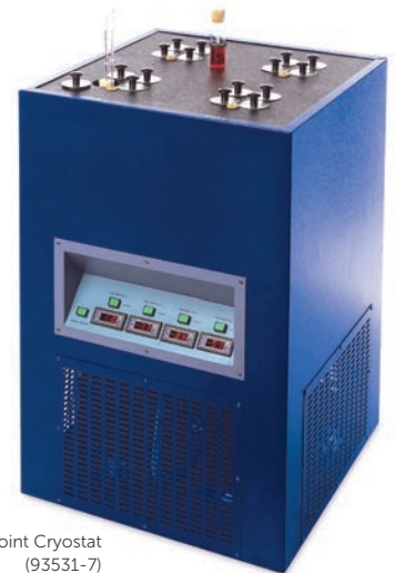
› Seta Cloud and Pour Point Cryostat (93531-7)

Visit: http://www.stanhope-seta.co.uk/3892/Seta-Cloud-and-Pour-Point-Cryostat