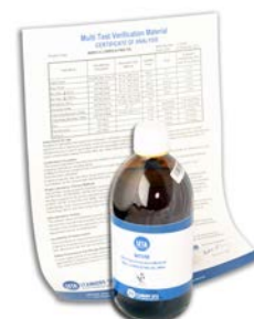
› Lubricating Oil MTVM (99853-2)