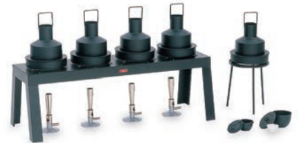
› 4-Way Unit (10600-0) and Single Unit (10610-0)

Visit: http://www.stanhope-seta.co.uk/36/Seta-Conradson-Test-Unit