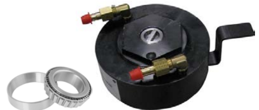
› Viscosity Shear Stability (19820-2)

An integral temperature probe connects to a external temperature control system.