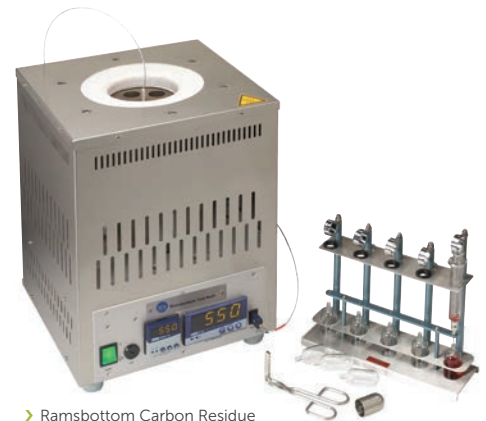
› Ramsbottom Carbon Residue (10900-4)