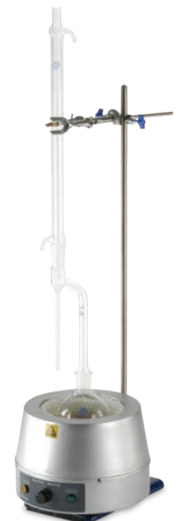
› Dean and Stark Assembly

Seta offer a range of flask heaters, stands and condensers for Dean and Stark Assembly, please visit our website for more information.