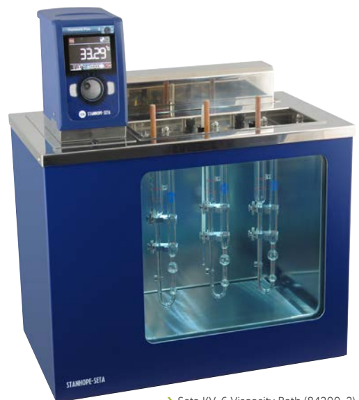
➤ Seta KV-6 Viscosity Bath (84200-2)

Each bath is supplied with a full factory calibration and graphical temperature trace of stability.