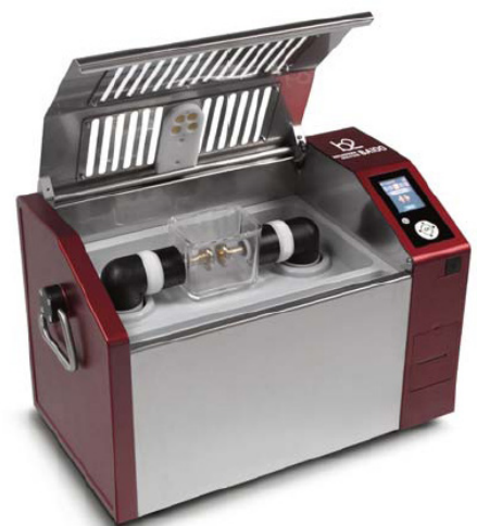
› Seta Dielectric Oil Tester (99620-3)

Visit: http://www.stanhope-seta.co.uk/4230/Automatic-Oil-Tester-100kv