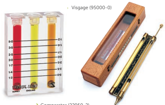
› Visgagge (95000-0)

Visit: http://www.stanhope-seta.co.uk/1925/Visgagge-range-40-800-Ss---light-oils