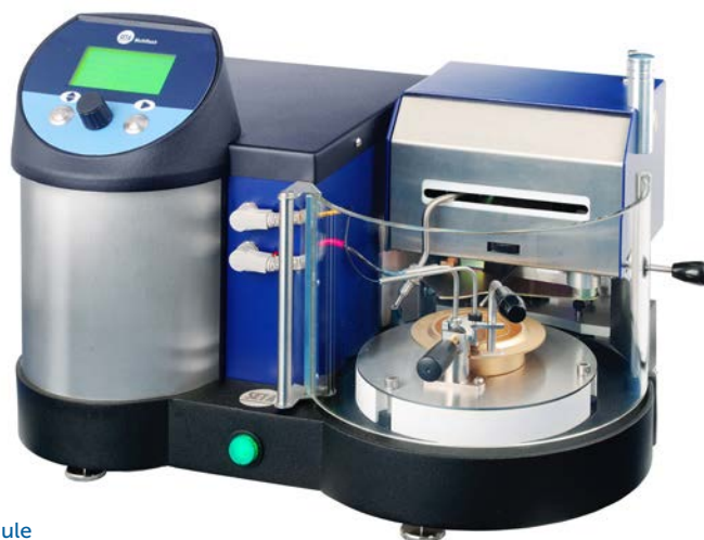
› Cleveland Multiflash (34300-2 and 34000-0)

Visit: www.stanhope-seta.co.uk/4340/Seta-Multiflash-Cleveland-Flash-Point-Module