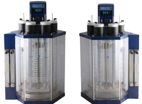
› Setafoam Dual Twin Foam Test Baths (14020-7)

Visit: http://www.stanhope-seta.co.uk/4448/SetaFoam-Dual-Twin-Foam-Test-Baths