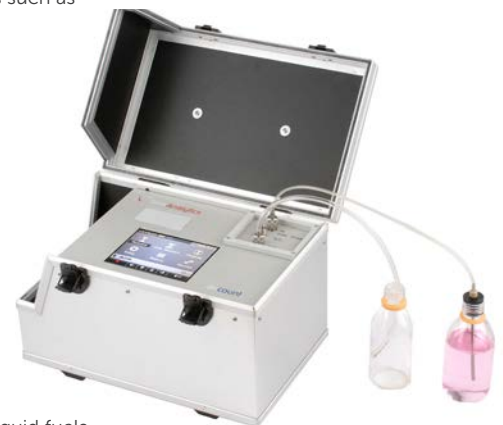
› Seta AvCount2 (SA1000-2)

Visit: http://www.seta-analytics.com/avcount2-particle-counter.htm