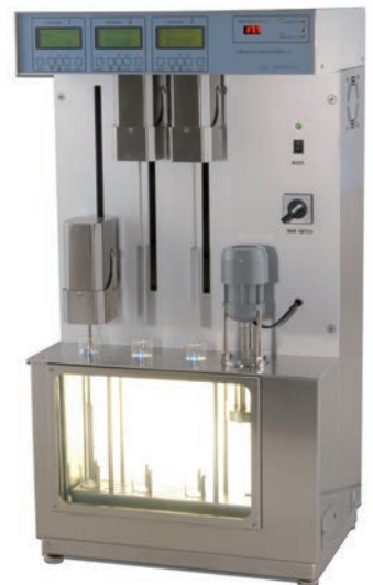
› Herschel Emulsifier (96700-2)