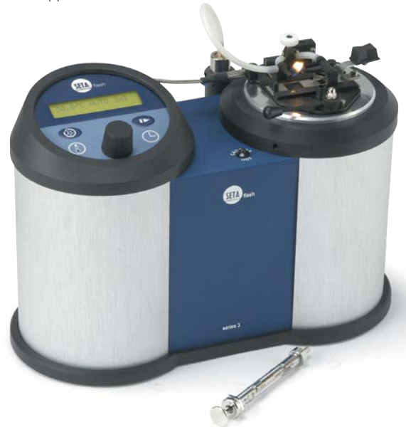
› Setaflash Series 3

View video online: www.stanhope-seta.co.uk/setaflash.html