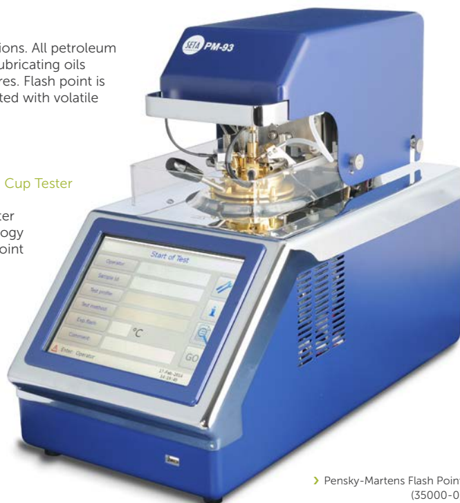
› Pensky-Martens Flash Point (35000-0)

Visit: www.stanhope-seta.co.uk/pm-93-flashpoint.html