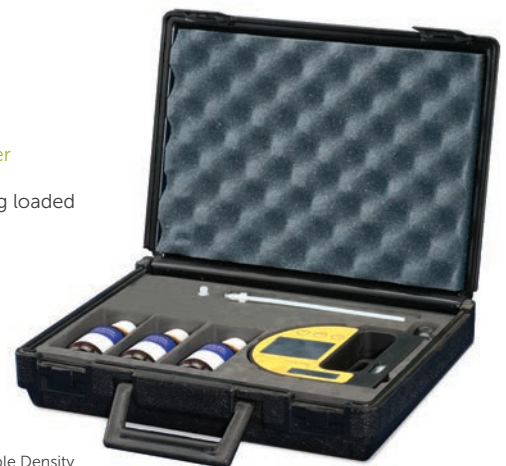
› Portable Density Measurement Kit (12600-0)

Note: Optional Hydrometers for ASTM D1298 are available from Seta on request.