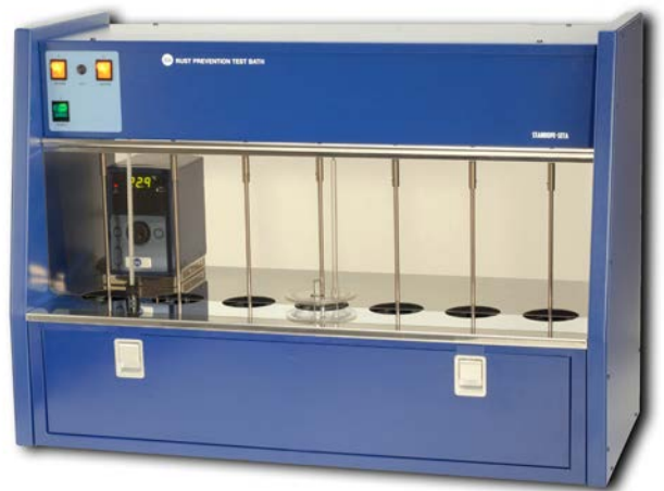
› Seta Rust Prevention Test Bath (11200-6)

Visit: http://www.stanhope-seta.co.uk/4470/Seta-Rust-Prevention-Test-Bath