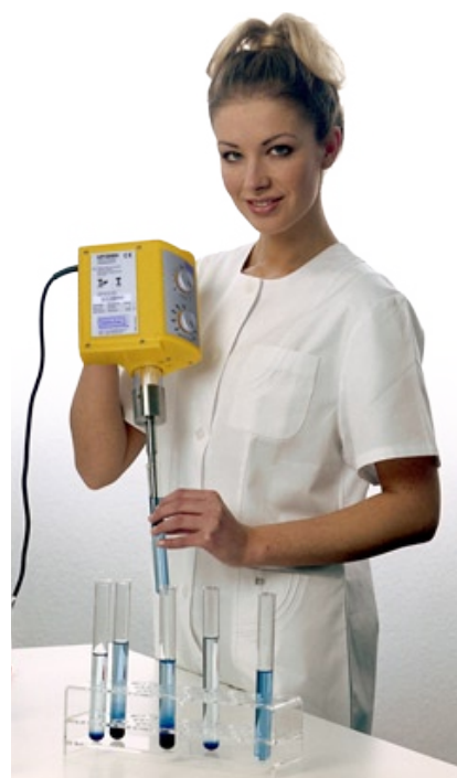
UP200H with S7

Using the sound protection box is recommended when running the UP200H for a longer time or often during the day. If you would like to operate the UP200H for a pre-defined time span, you can use the timer. This will shut the UP200H off after the time has elapsed.