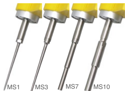
MS1 MS3 MS7 MS10