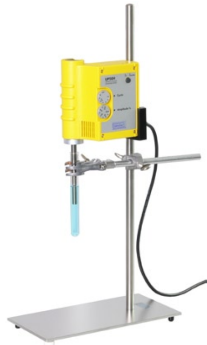
UP50H with MS7 at Stand ST1-16

For samples volumes from 0.1mL up to 250mL we offer various replaceable sonotrodes with diameters 1mm, 3mm and 7mm. The timer allows to pre-define a sonication period. This is very helpful for routine sonication processes. The sound protection box reduces the noise level. We recommend this box when sonicating for a longer period, e.g. 5 minutes.