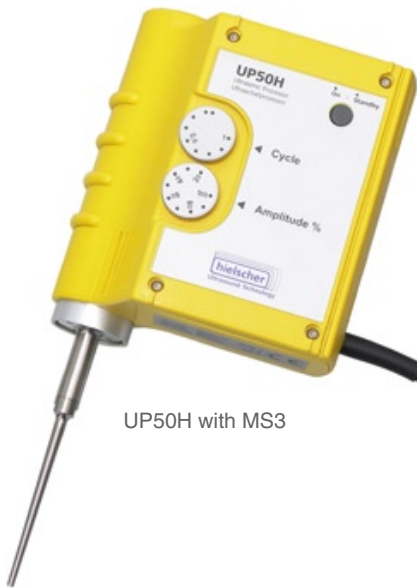
UP50H with MS3