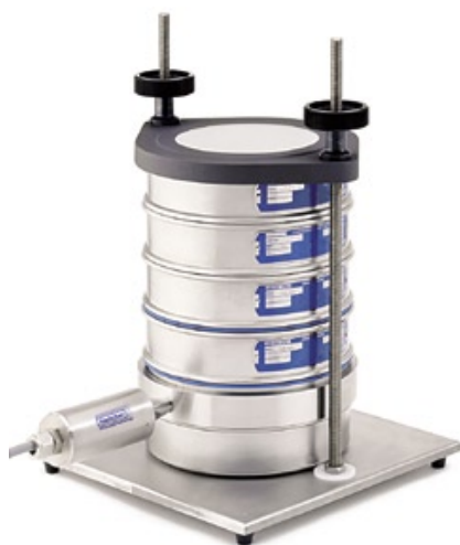
Ultrasonic Sieving System