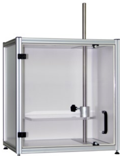
Sound Protection Box SB3-16

The ultrasonic processor UP200H (200 watts, 24kHz) is the most powerful handheld ultrasonic device. The UP200H is well suited for all general ultrasonic applications in small and medium scale. The applications include: Homogenization, disintegration, emulsification, cell disruption, degassing or sonochemistry. The UP200H can be operated at a stand, too. Sample volumes from 5 to 2000ml can be sonicated with sonotrodes of a diameters from 3 to 40mm.