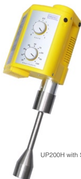
UP200H with S40