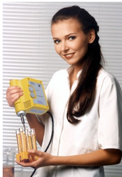
UP100H with MS3

The ultrasonic processor UP100H (100 watts, 30kHz) has the same compact and ergonomic design as the UP50H but it comes with twice the ultrasonic power. At 1.1kg, it is lightweight in the hand. Of course, an operation at a stand is possible, too. The ultrasonic generator and the transducer are combined in one unit, so that there are no hassles with connecting cables. One power supply cable - that's all. Using the 3mm, 7mm or 10mm sonotrode the UP100H is most suitable for the ultrasonication of samples from 0.1mL to 500mL. The UP100H can be operated in the sound protection box for lower noise emissions. The timer allows to sonicate for a pre-defined time span.