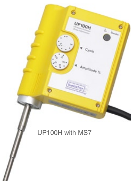
UP100H with MS7