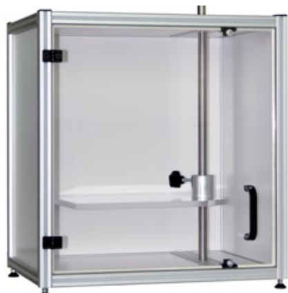
Sound Protection Box SB2-16

The ultrasonic processor UP50H is used in particular in medical, biological or chemical laboratories, where small volumes need to be sonicated. Application fields are found mainly in the analytical field with applications such as the disruption of tissues, the cracking of bacteria or the homogenizing of samples in the food industry.