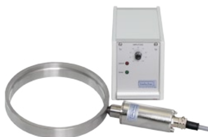
UIS250L with RIS200