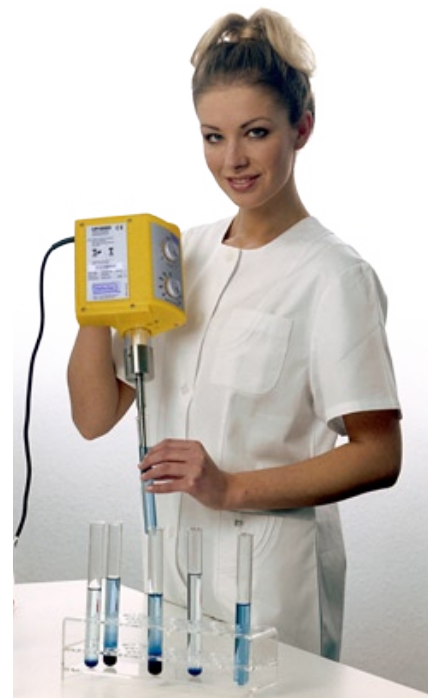
UP200H with S7

We offer a comprehensive range of accessories for the UP200H such as flow cells, stand, sound protection box, timer and PC-control.