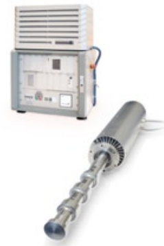
ultrasonic industry processors