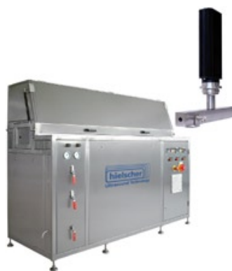
wire-, tape- and profile cleaning