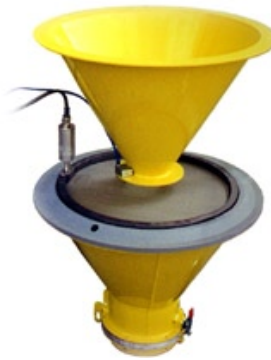
industrial ultrasonic sieving