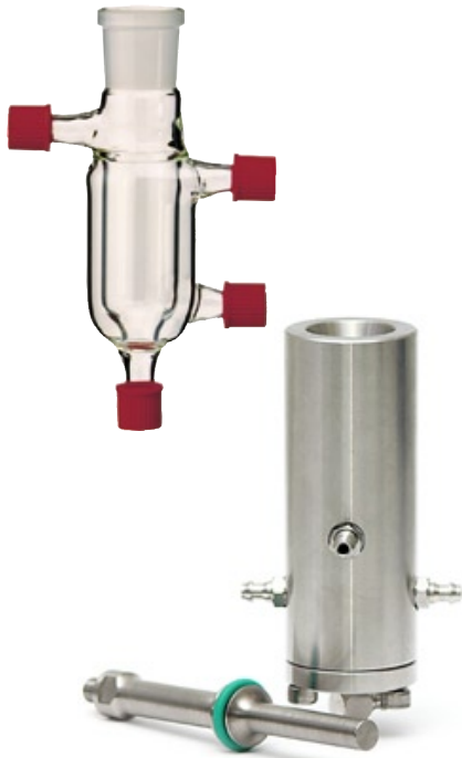
flow cells GD7K and D7K

The ultrasonic processor UP100H (100 watts, 30kHz) has the same dimensions as the UP50H but it is suited for the double power output. With the use of the 10mm sonotrode the field of applications expands to applications with volumes of up to 500ml.