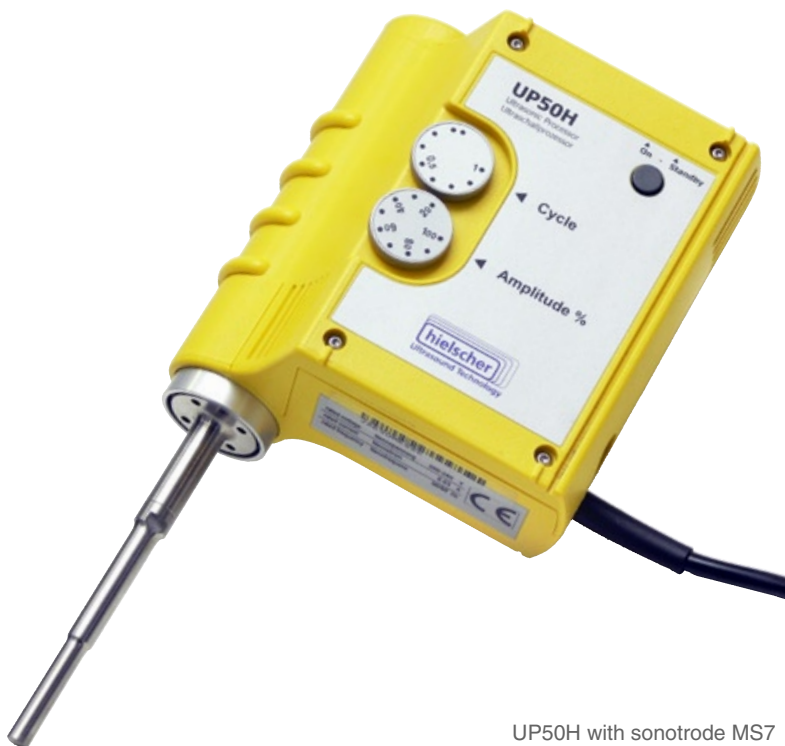
UP50H with sonotrode MS7

The ultrasonic processor UP50H (50 watts, 30kHz) is the smallest model of our aesthetic laboratory devices, that are only supplied by Hielscher Ultrasonics in that compact form.