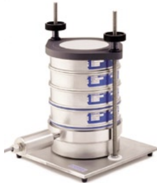
ultrasonic sieving in the laboratory