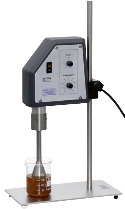
UP200S with S40

As all our laboratory devices the UP200S finds its customers worldwide. Without any additional fees we supply our devices for local power supplies from 100 to 240V and with the corresponding plugs.