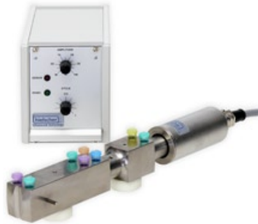
sonication of closed vials