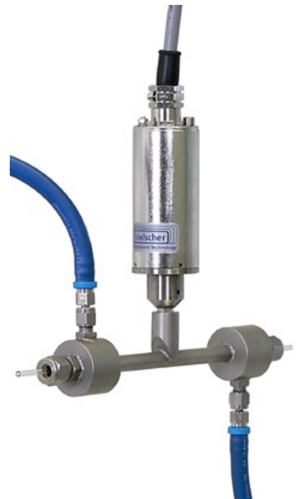
contamination free flow cell Dmini

For our ultrasonic processors we offer flow cells made of glass or stainless steel. The liquid to be sonicated is led in from below and passes through the cavitation zone under the sonotrode. The appropriate sonotrodes are equipped with O-rings, that are fitted closely to the cell wall or the PTFE-adaptor. For higher pressures and temperatures the sonotrodes may be equipped with metallic oscillating-free flanges that are mounted to the stainless steel flow cells. The selected flow rate corresponds to the energy input required. The temperature of the medium can be influenced by means of a cooling jacket. Special designs of the flow cell, e.g. several supply connectors when emulsifying, are manufactured according to the demands of the customer. A new product in our product range is the mini flow cell (patent pending). When using this mini cell, the medium is hermetically sealed, so that the sonication can be realized without contamination.