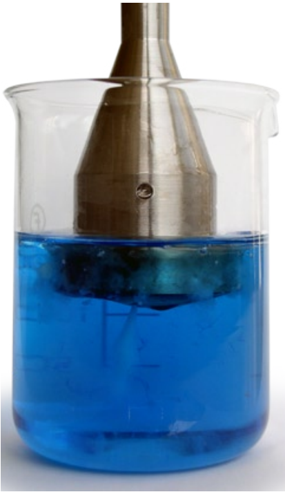
cavitation at S40

The ultrasonic processor UP200S (200 watts, 24kHz) differs from the UP200H only with its shape and its use only with stand.