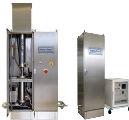
ultrasonic dispersing systems