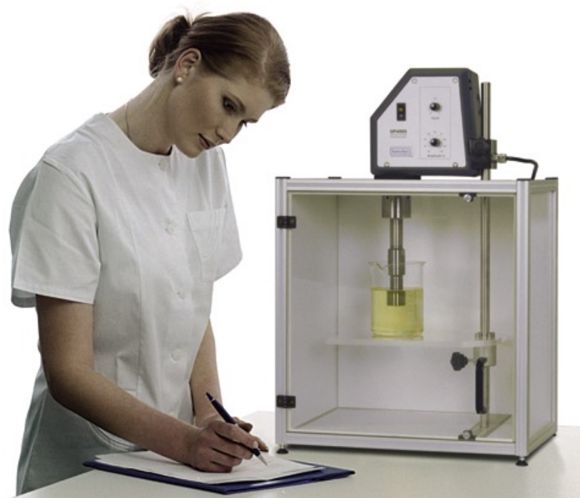
UP400S with H22 in sound protection box

The ultrasonic processor UP400S (400 watts, 24kHz) is our most powerful laboratory device. With sonotrodes of a diameter range from 3 to 40mm the device is suited for sample volumes from 5 to 4000ml. In flow approx. 10 to 50 liters per hour can be treated. For the preparation of test portions the UP400S is mainly used for bigger volumes. It is suited for the practical process development in the laboratory but also in the college of technology as well as for the production of small quantities. For production quantities a PC-control or a connecting lead to a central control of the user's plant is recommended in order to raise the process safety. With special flow cells and flange connections liquids can also be sonicated at high temperatures and pressures.