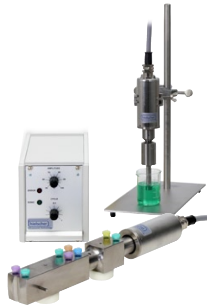
VialTweeter (front) and sonotrode (back) at ultrasonic processor UIS250v

The VialTweeter can be cleaned and disinfected easily. The VialTweeter is autoclavable and the transducer of the UIS250v is made of stainless steel (IP65, NEMA4). The generator is connected to the transducer by a 4m connection cable. Alternatively to the VialTweeter, the UIS250v can be equipped with sonotrodes for direct immersion into liquids. In that way, the UIS250v can be used as a hand-held or stand-mounted homogenizer.