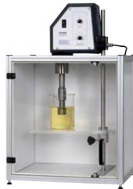
ultrasonic laboratory processors