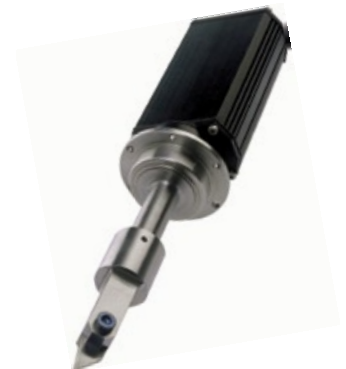
cutting and welding