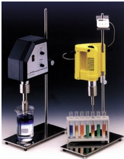
UP400S and UP200H with timer

As desk-space in the laboratory is expensive we supply ultrasonic processors in a compact design: Power supply, generator, control and transducer, all of which are located in an aesthetic housing. No additional cables impede.