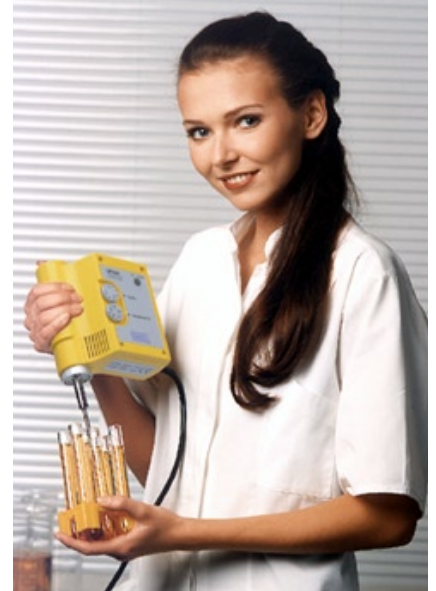
UP100H with MS3

For continuous operation only a flow cell and the appropriate 7mm sonotrode is required. Continuous processes in the smallest scale can be simulated. The optional PC-control may be helpful, if a test record is necessary or to optimize processes.