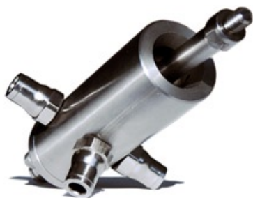
stainless steel flow cell D7K with MS7D